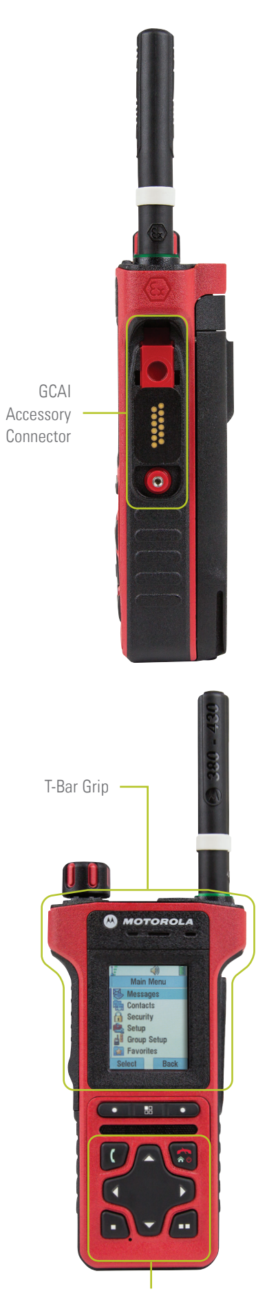
The MTP8500Ex has a limited keypad, ideally suited for use while wearing heavy gloves. For users that need a full keypad we offer the MTP8550Ex.